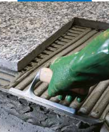
External installation of relief terrazzo "graniglie" tiles

– tiling to timber where it's screw fixed and rigid.