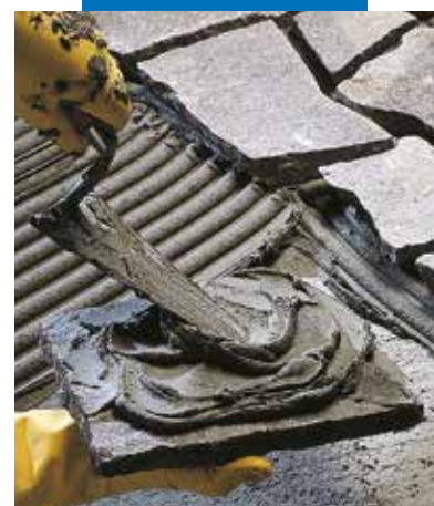
Installation of external hewn back stones with or without buttering, depending on thickness