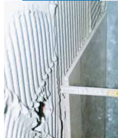
Thickly applied porcelain tiles on a wall