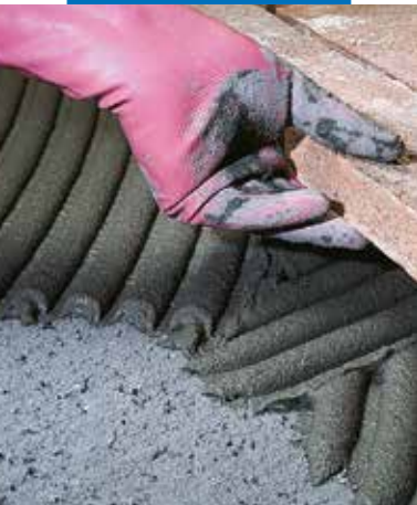
Installation of hand made terracotta on an uneven substrate