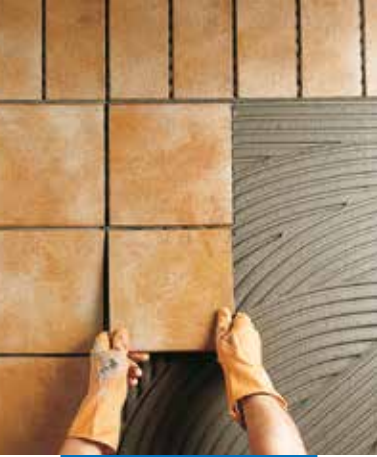
External installation of klinker tiles